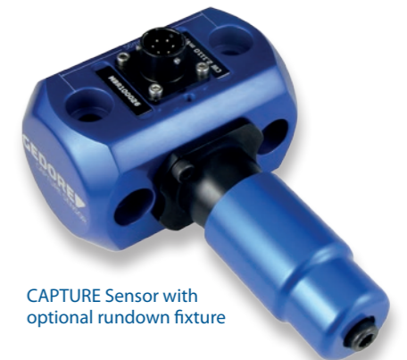
CAPTURE Sensor with optional rundown fixture

Calibrated range: 10% to 100% of capacity