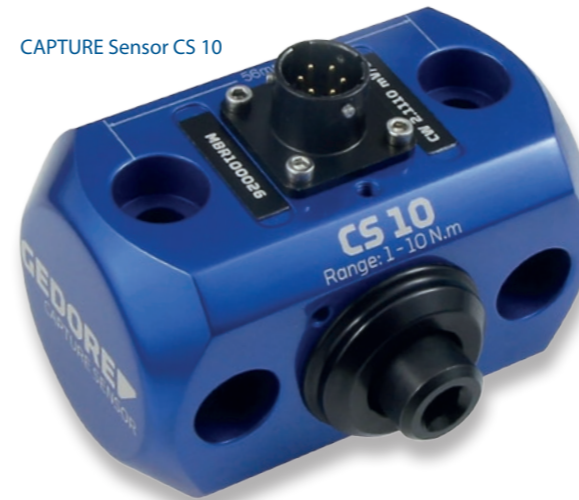
CAPTURE Sensor CS 10

The CAPTURE Sensor is part of the industry-leading CAPTURE system, providing highly accurate torque measurement for Hand and Power Torque Tools.