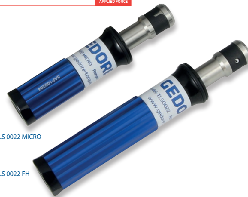
TLS 0022 MICRO